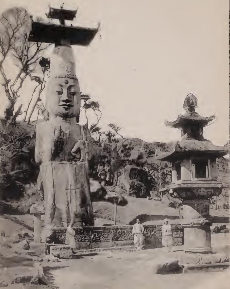
忠清南道恩津郡定山面灌燭寺內彌勒菩薩の大石像 (忠南 2) A BIG STONE STATUE OF BUDDHE (所名鮮朝)